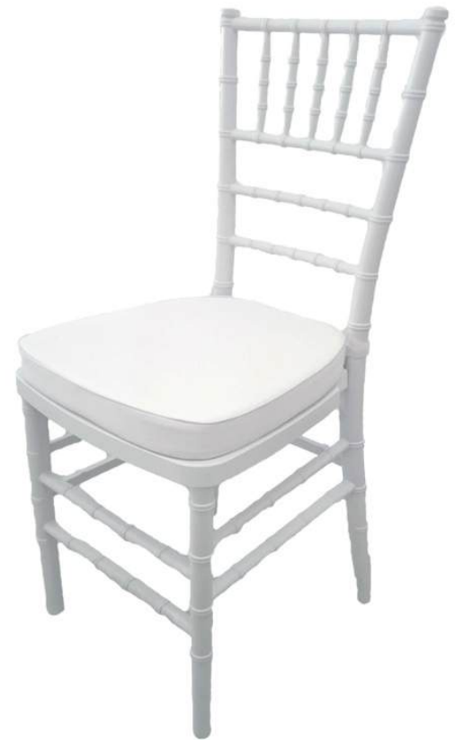
White Tiffany Chair