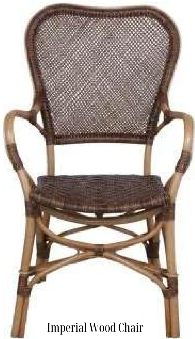
Imperial Wood Chair