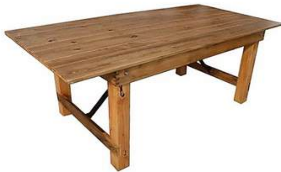
Rustic Wood River Table