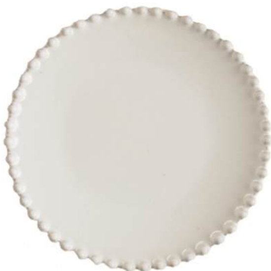
Pearl White Plate