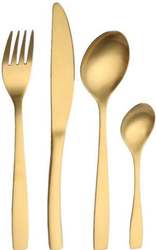
Gold Cutlery Set