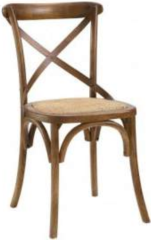
Crossback Wood Chair