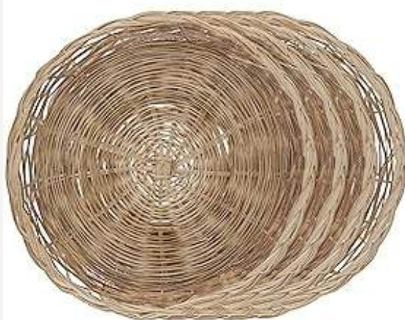
Rustic Base Plate